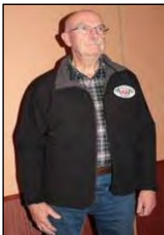
Club Jacket with Badge $147.00