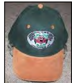
Baseball Hat $17.50