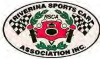
RSCA Cloth Patch $7.00