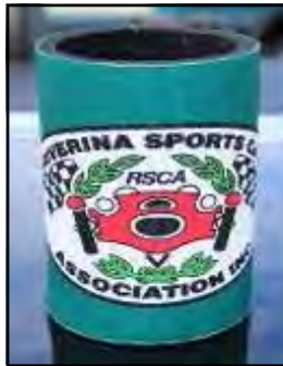
Stubby Holder $8.50