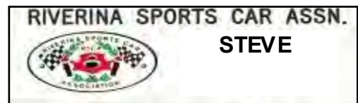
Replacement RSCA name $5.50