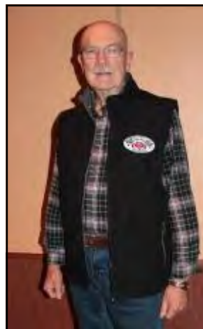
Club Vest with Badge $75.00