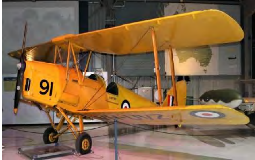
Temora Air Museum Lambaguini Car Club Temora Rail Museum