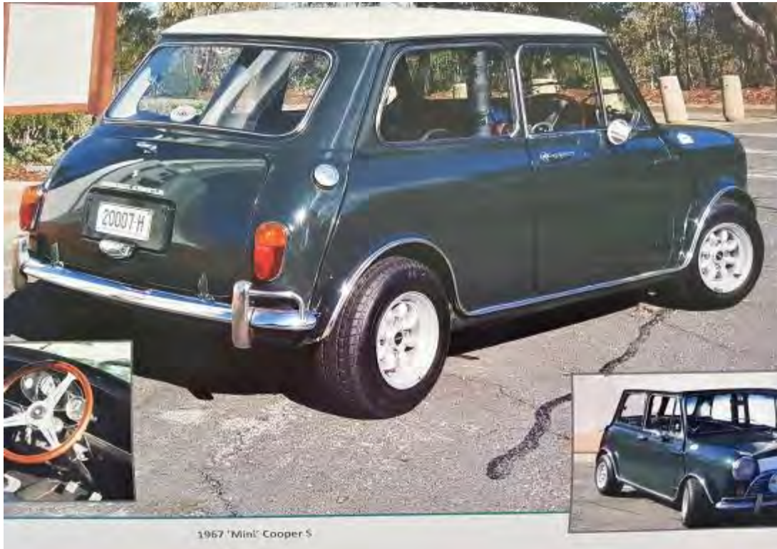
1967 'Mini' Cooper S

In 1959 Sir Alec Issigonis released his grand design, the Mini minor on the unsuspecting public. A vehicle designed with an 848cc engine, front wheel drive, a wheel in each corner of the body extreme to maximise interior space & economical. It was an immediate hit with the motoring public & racing fraternity alike.