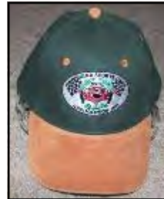
Baseball Hat $17.50