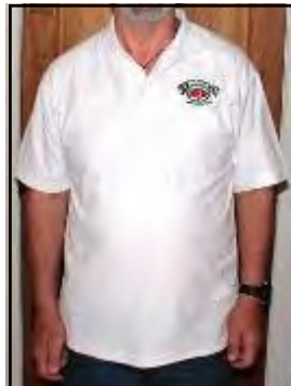
Polo Shirt with Badge $32.00