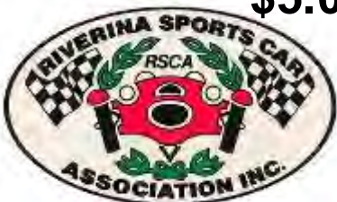
Self Sticking Car Badge $2.50