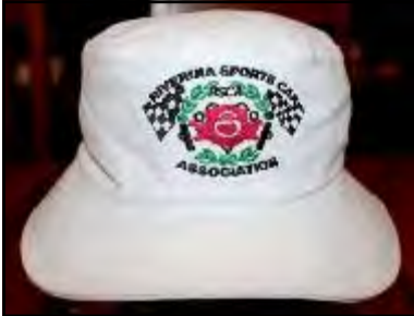
Bucket Hat $15.00

Contact Warwick Jones on 0260 212 377 (b/h) or 0260 214 195 (a/h) if you wish to purchase any items.