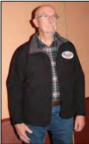
Club Jacket with Badge $147.00