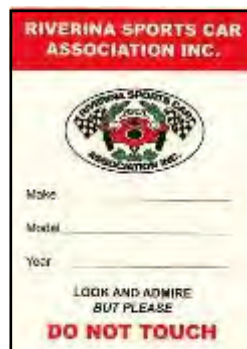
Laminated Car ID $2.00