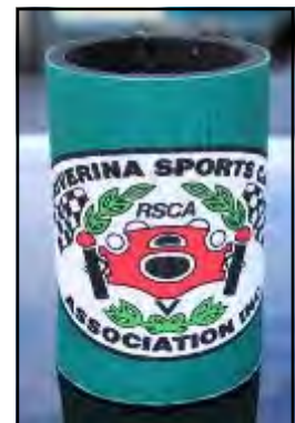
Stubby Holder $8.50