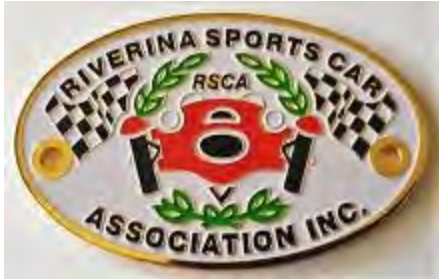
NEW!! Car Grill Badge $25.00

Contact Warwick Jones on 0260 212 377 (b/h) or 0260 214 195 (a/h) if you wish to purchase any items.