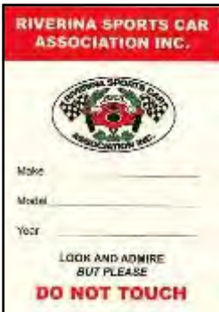
Laminated Car ID $2.00