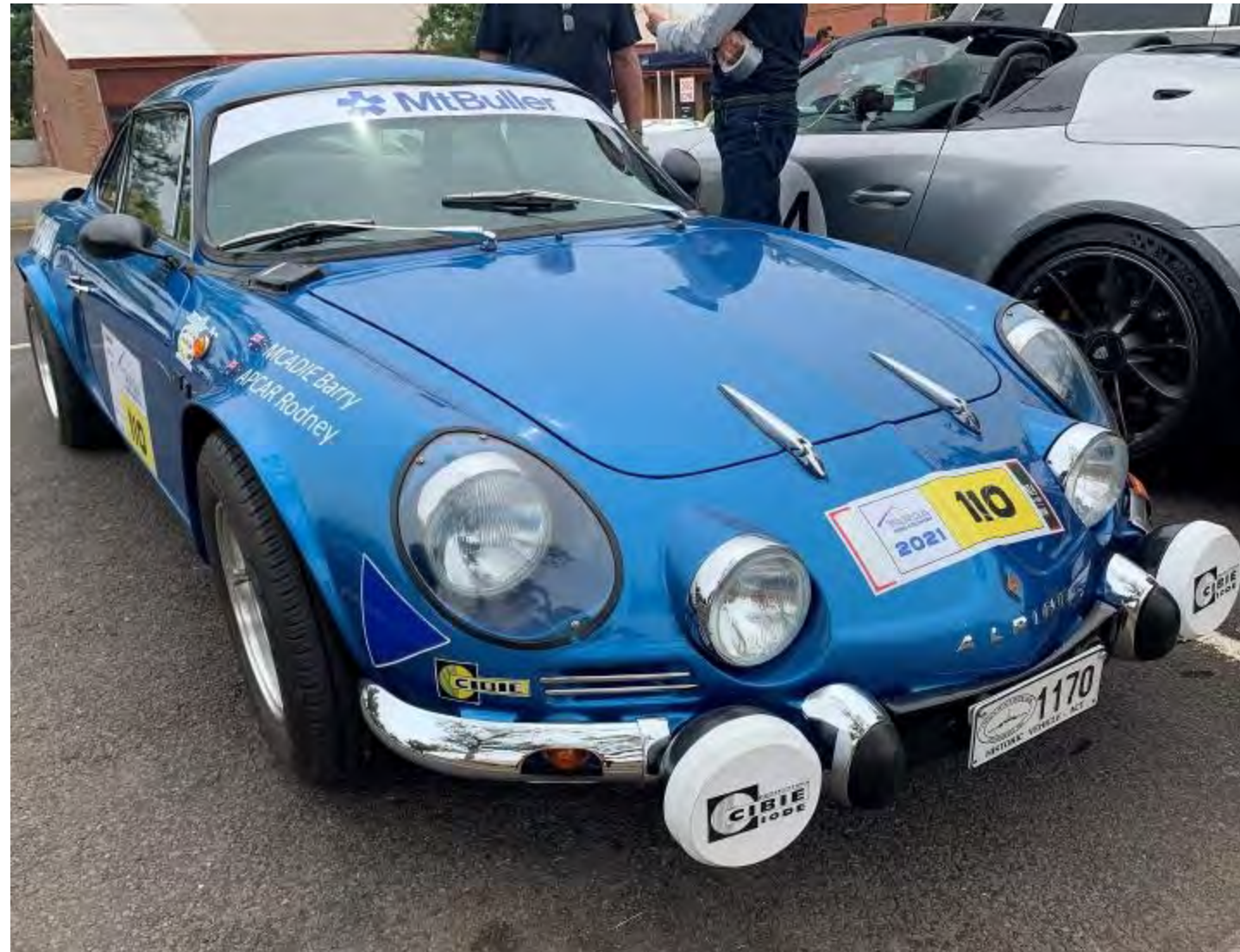
"S" type Jaguar. (The Jaguar owners were from Cairns Qld)