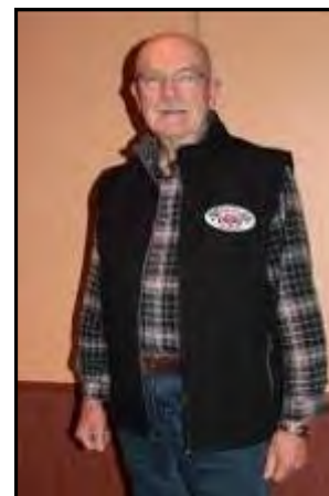
Club Vest with Badge