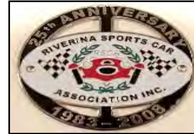
Car Grill Badge