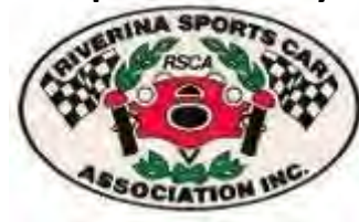
RSCA Cloth Patch