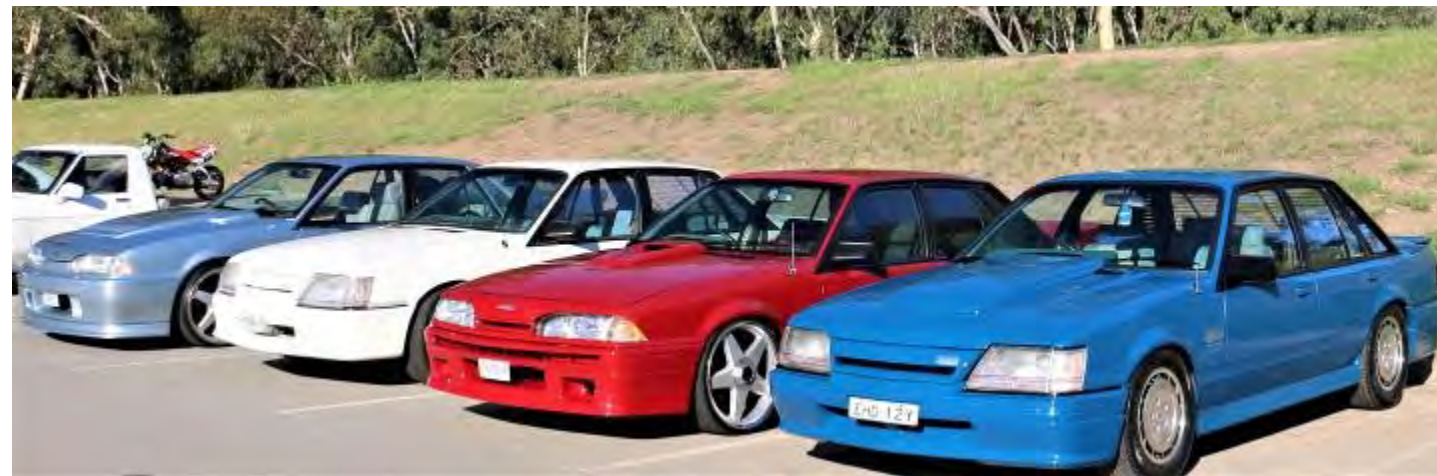
SS HOLDEN COMMODORES