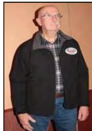
Club Jacket with Badge