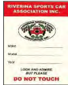
Laminated Car ID