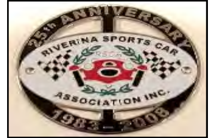
Car Grill Badge