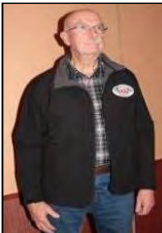
Club Jacket with Badge