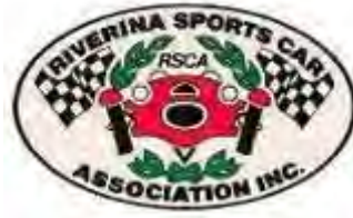
RSCA Cloth Patch