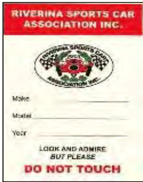
Laminated Car ID