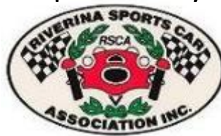
RSCA Cloth Patch