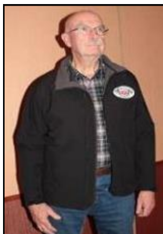
Club Jacket with Badge