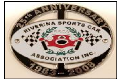
Car Grill Badge