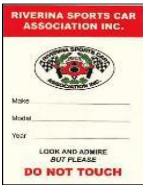
Laminated Car ID