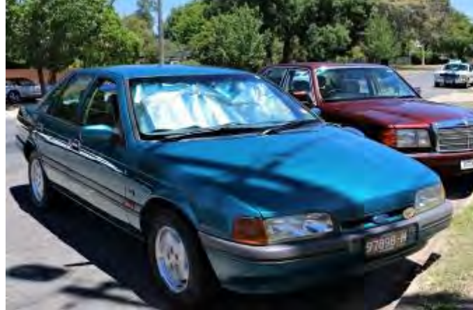
RSCA Takeover of Main St